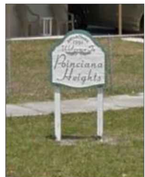
POINCIANA HEIGHTS NEIGHBORHOOD SIGN (PHASE 1)