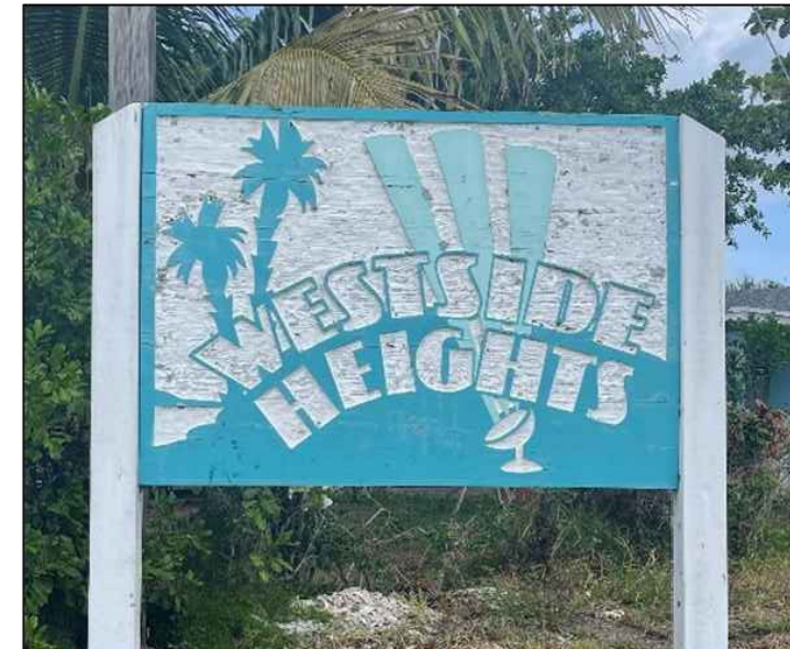
WESTSIDE HEIGHTS NEIGHBORHOOD SIGN (PHASE 1 & 2)