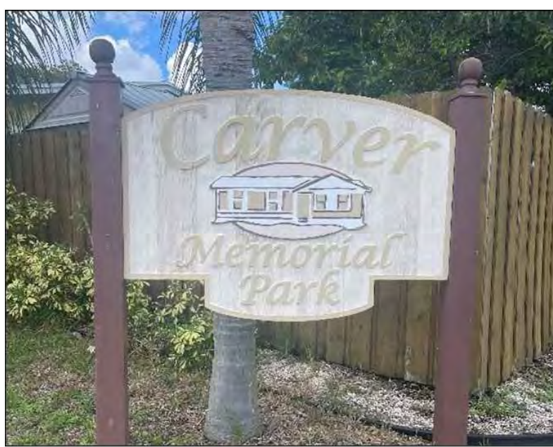
CARVER MEMORIAL PARK NEIGHBORHOOD SIGN (PHASE 1)