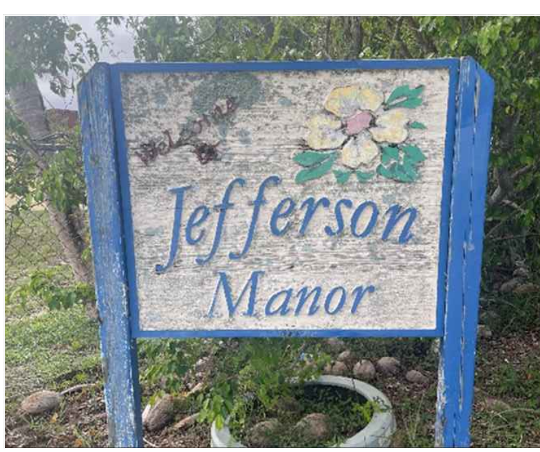
JEFFERSON MANOR NEIGHBORHOOD SIGN (PHASE 1)