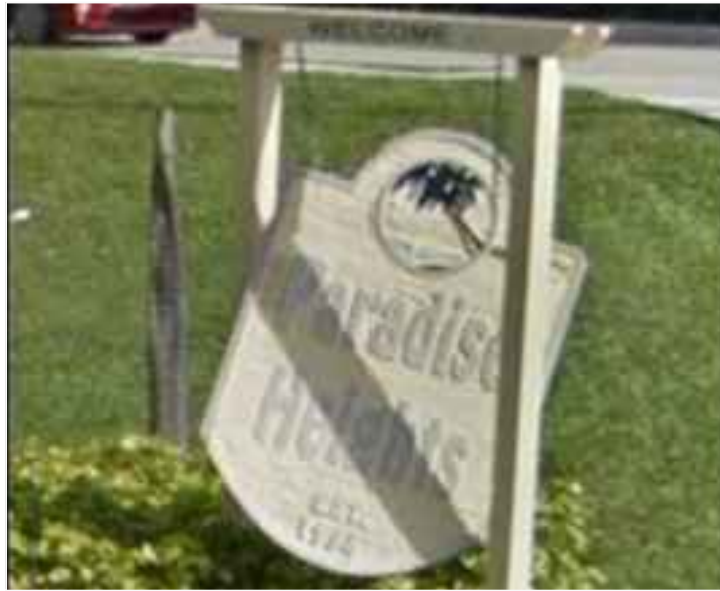
PARADISE HEIGHTS NEIGHBORHOOD SIGN (PHASE 1 & 2)