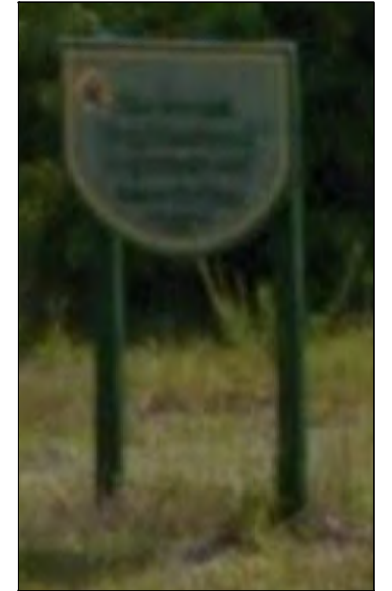
NW COMMUNITY IMPROVEMENT ASSOCIATION NEIGHBORHOOD SIGN (PHASE 3)